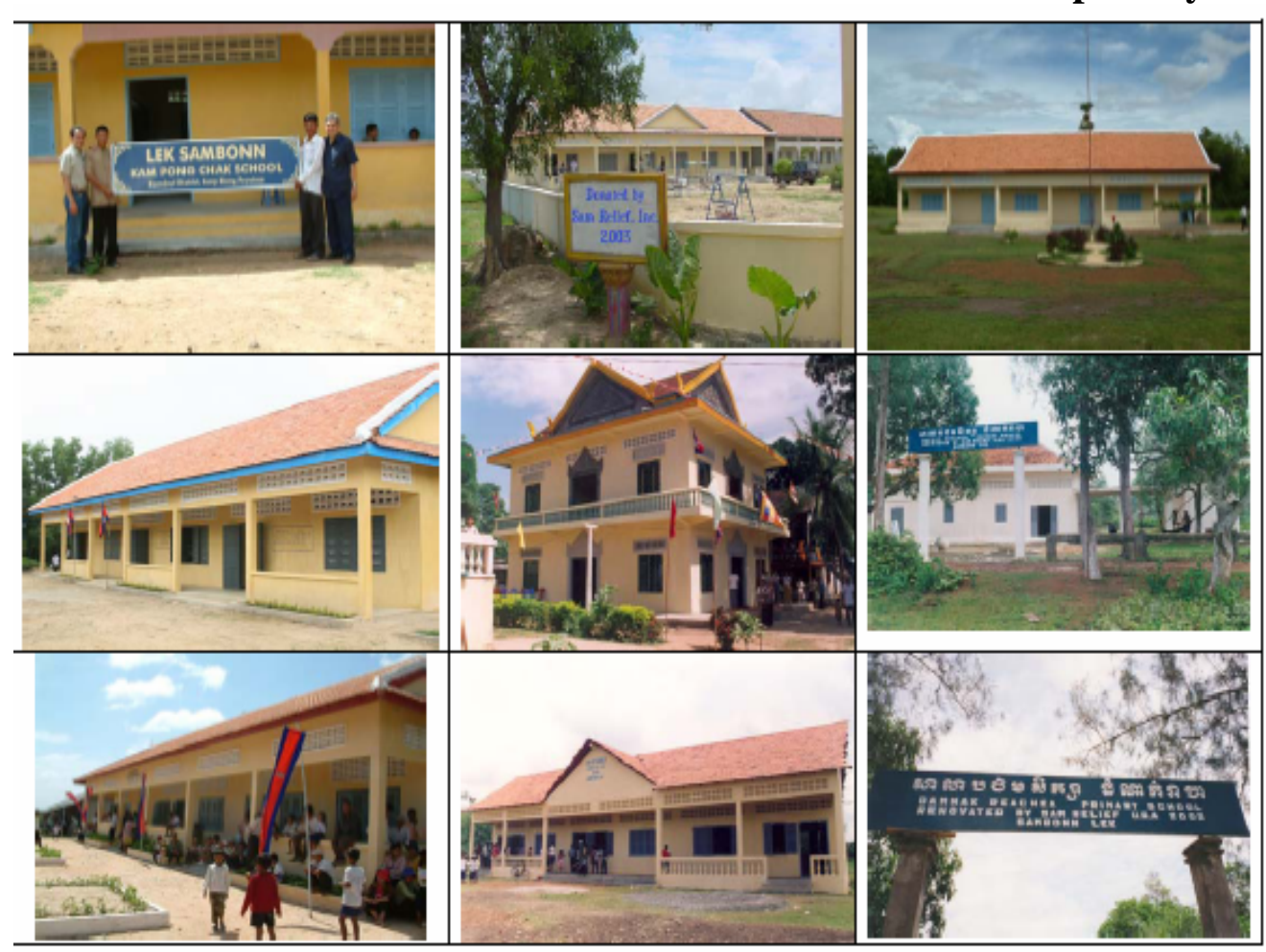
These pictures are the results of your charitable donations.